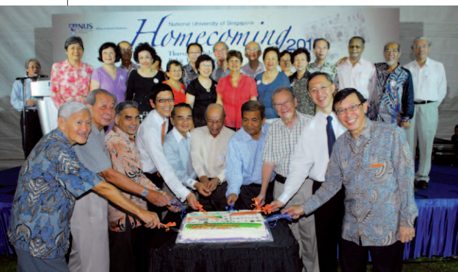
CAKE-CUTTING CEREMONY: Class of 1960 celebrating the golden anniversary of their graduation with dinner guests

Homecoming @ KRC on 10 July 2010 also saw 12 students being presented with the NUS Alumni Student Exchange Award and 185 new alumni from the Class of 2010 being appointed as Class Ambassadors, that is, alumni leaders who will be encouraging their cohort of friends to stay connected with one another and with their alma mater. ■