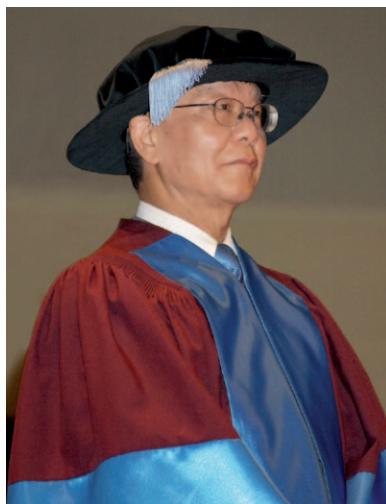
CHIEF JUSTICE CHAN: He blazed a trail of firsts for an alumnus of the NUS Law Faculty – the first Judicial Commissioner in 1986, then Judge of the Supreme Court in 1988, the first Attorney-General in 1992, and the first Chief Justice in 2006

law and its influence will continue to be greatly felt in the years to come."