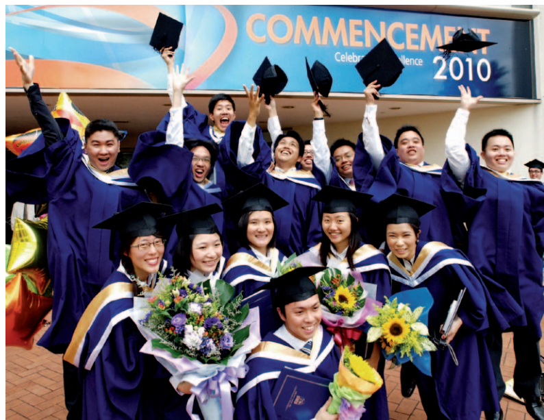
CELEBRATORY MOOD: The new graduates posed for pictures after their commencement ceremony