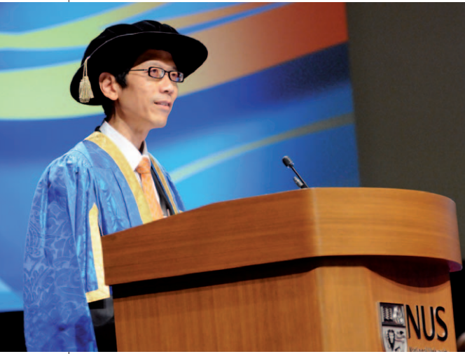
COMMENCEMENT SPEECH: NUS President Prof Tan Chorh Chuan urged the new graduates to stay curious, pursue their passion and value the community around them

Chief Justice Chan was conferred an Honorary Doctor of Laws at the main commencement ceremony. He was recognised for his leadership of the Singapore judiciary, his outstanding contribution to the development of Singapore's criminal justice system and constitutional law, distinguished service to the nation, and long-standing and continuing support to the Faculty of Law of NUS. ■