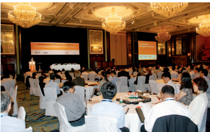
RISK MANAGEMENT CONFERENCE: It was attended by some 200 local and international participants from government agencies, academia and industry