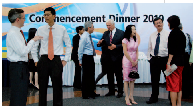
COMMENCEMENT DINNER: An evening of great conversation and camaraderie among the dinner guests

three distinctive characteristics: "an unrelenting, fierce determination to excel, despite the odds; the courage to be intelligently different, while keeping true to what we really are; and the boldness to break new ground."