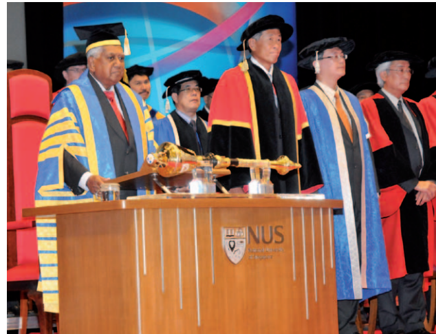
MAIN COMMENCEMENT CEREMONY: Presiding over the ceremony was President of Singapore and NUS Chancellor Mr S R Nathan

"Curiosity is crucial for life-long learning which, in turn, is essential for us to keep pace with the rapid changes in knowledge and technology," he said. As for pursuing one's passion, he noted that "most of us are more likely to succeed and to make a difference, if the goals and paths we pursue hold a deep and real significance